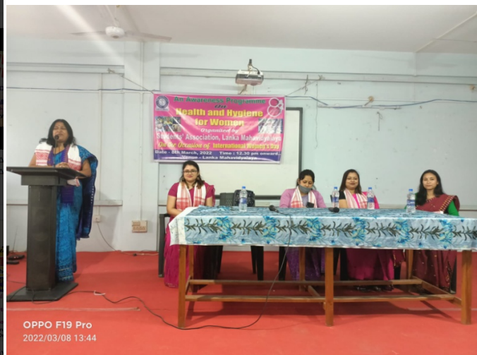
Program on Health & Hygiene for Women , organized by Students Association, Lanka Mahavidyalaya, Lanka, Assam on 8-3-2022