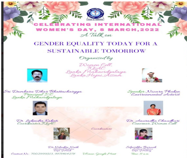
Gender Equality for a Sustainable Tomorrow on 8/3/2022 Organized by Women Cell, IQAC, Lanka Mahavidyalaya