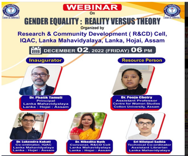
Webinar on : Gender Equality : Reality versus Theory On 02/12/2022