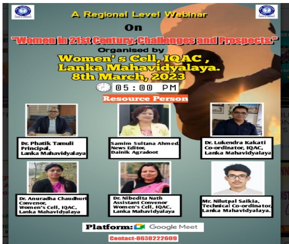
Webinar on "Women in 21 st Century : Challenges and Prospect "