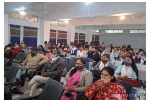
Date & Time: 21/01/2021, At- 12.30 PM Onwards