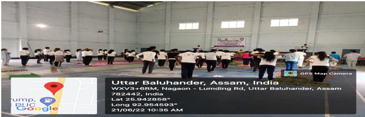
4. YOGA Day Celebration: To inculcate sense of spiritual values and synchronization of body soul and mind