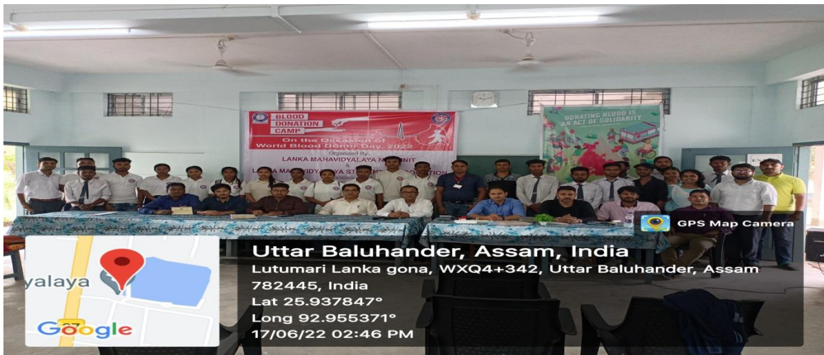
5. To inculcate sense of moral and social responsibilities the Blood donation camp was organized-2022.