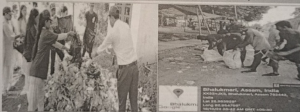
NSS Volunteers' Participation in Clean India Campaign 2.0 [Mission -October-2022]