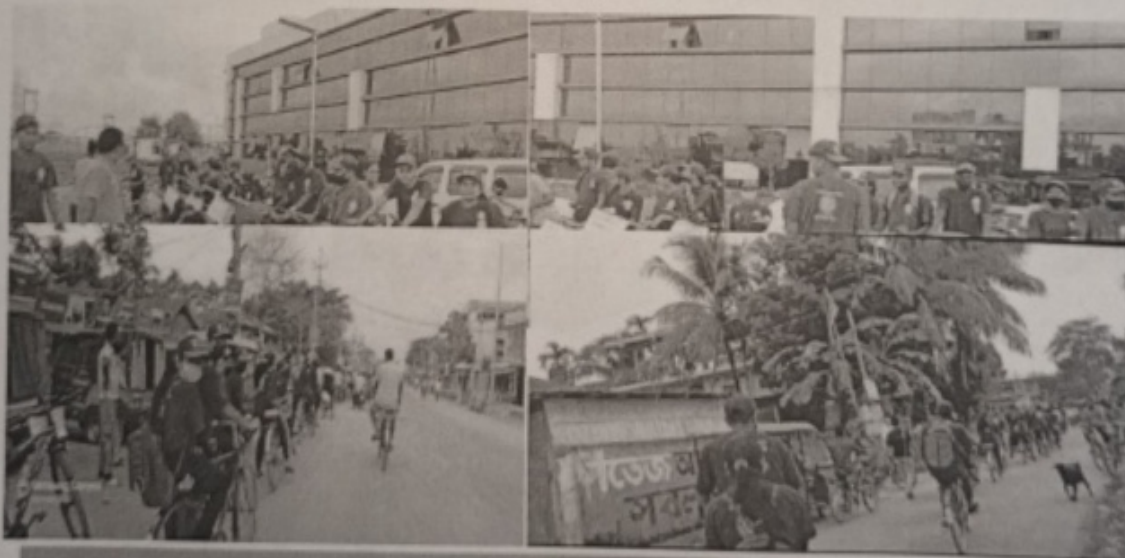
Cycle Rally for Environmental Awareness in Lanka Town-2022